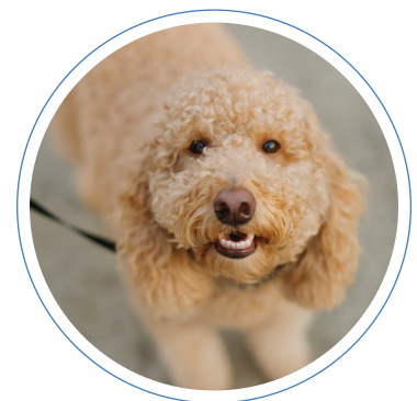
Douglas Beloved Therapy Dog

Thanks to a generous grant from the Legacy Health Endowment, 89 children and teens and 35 adults participated in the organization's family day camp in the summer of 2018. Campers engaged in a wide array of therapeutic activities made possible by volunteers and businesses who partnered with Jessica's House to make the camp a reality. Activities included karate, yoga, dance, drum circles, painting, poetry and more. Families also loved interacting with two therapy dogs. An overnight camp will take place in Summer 2019.